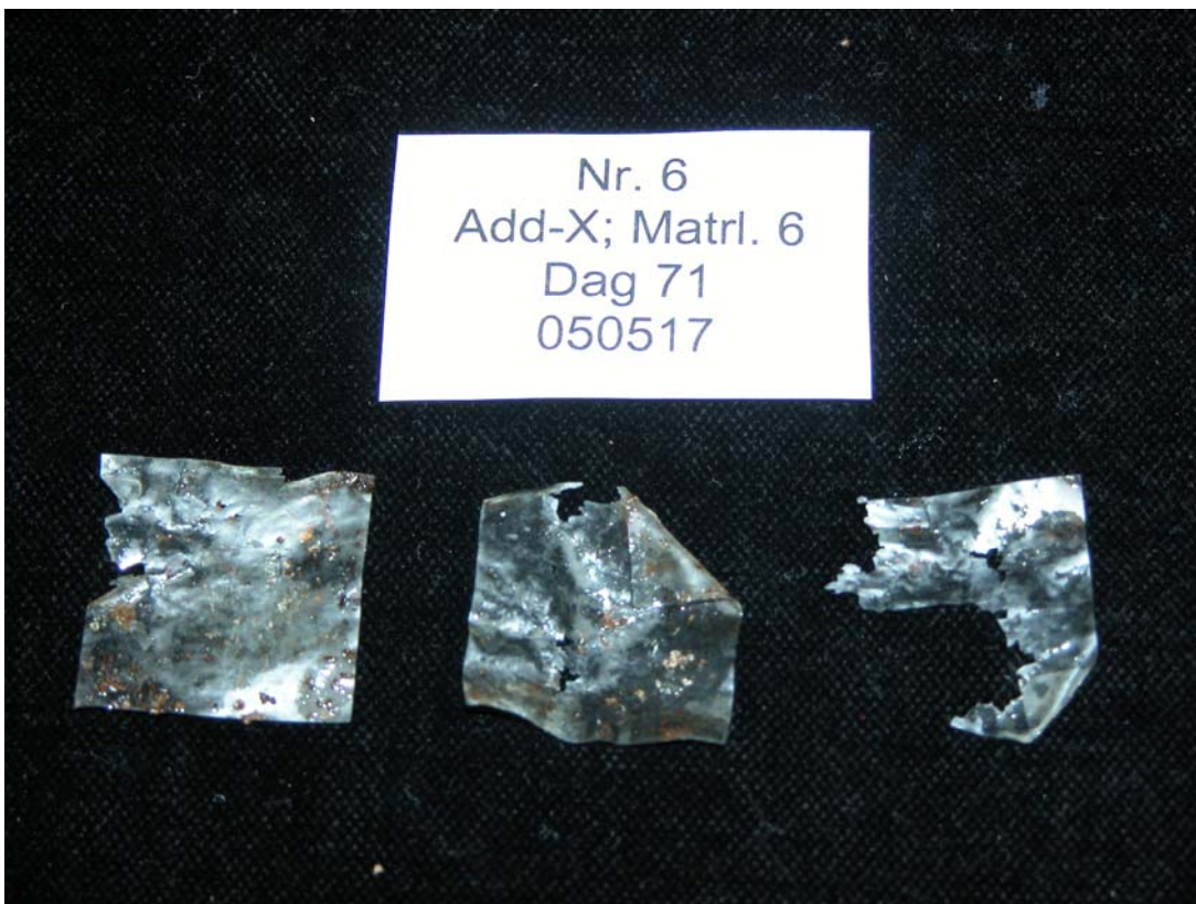
Picture 2. Test pieces of the material after 71 days of the thermophilic incubation period in the compost. The material is brittle and bears traces of disintegration.