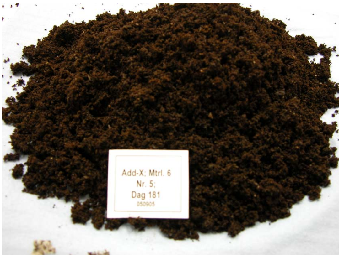
Picture 3. Compost containing test material after 90 days of thermophilic incubation period followed by 91 days of mesophilic incubation period. It is not possible to discern the test material except some small pieces in a very few cases.

SP Swedish National Testing and Research Institute Chemistry and Materials Technology - Polymer Technology